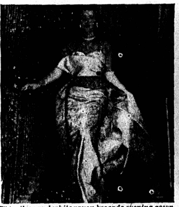
This silver and white rayon brocade evening gown shows a double collar which accents the petal line of the corsage. It falls into a sweeping train.