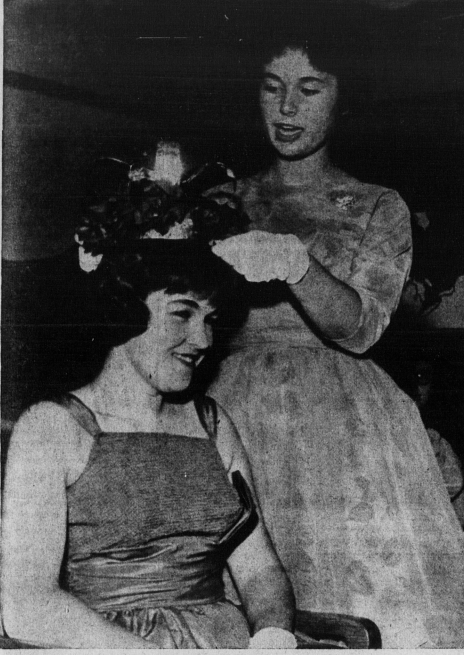
P.E.I. DAIRY PRINCESS IS CROWNED

Mostly cloudy, continuing warm, light winds. Low-high at Charlottetown 60 and 78.