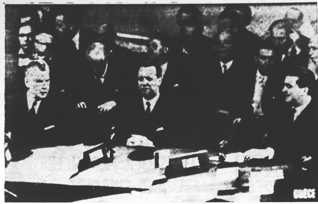
DIEFENBAKER AT CONFERENCE TABLE

Canadian Prime Minister John Diefenbaker, left, looks toward opening meeting of NATO summit conference in Paris. Prime Minister Hans Hansen of Denmark is seated at center, and Premier Felix Gaillard of France is seated at right. Wirephoto by radio from Paris.