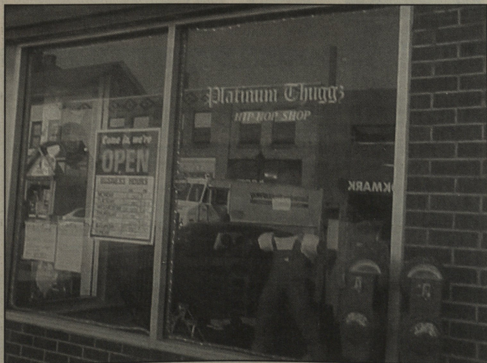
Platinum Thuggz: Charlottetown's only hip-hop store

Apb explains, "I'm totally against a sanctioned spot for kids to go. That's wack as hell. It takes all the meaning away from graf and turns it into nothing more than a style. Graf is supposed to be a weapon against all the ugly shit that's in our city. Public space has been sold to private interests (i.e. advertisers and the businessmen who hire 'em) and we're subjected to what they want us to be subjected to all the time. I think it sucks. Public space should be free of all that ugly shit. They try to fool us