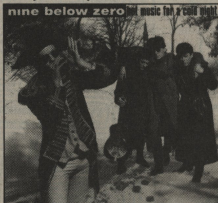
Nine Below Zero Hot Music For A Cold Night (Pangea/EMI)

A superb modern blues album. Nine Below Zero is a rare commodity in the blues community, a completely original band. Their sound is defiantly unique. The guitars are heavy, the harp is wailing and the groove ranges from hard rock to funk-blues.