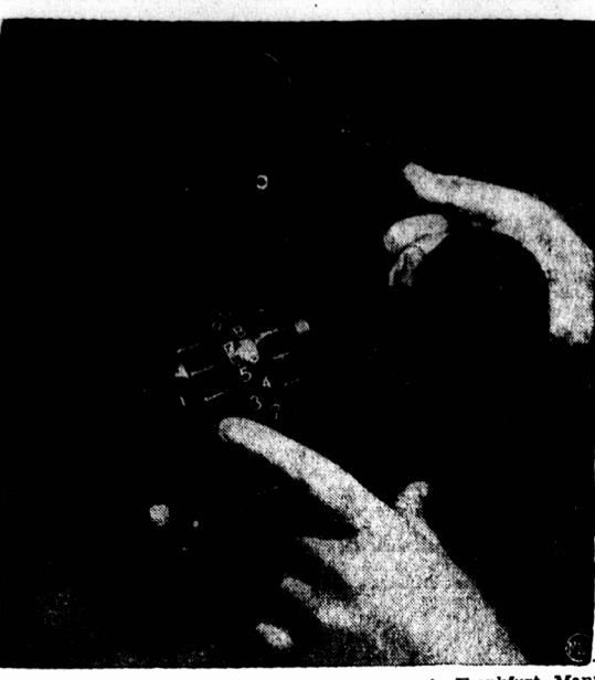
DIFFERENT DIAL—A cylinder replaces the conventional dialing disk on this new German telephone, shown in Frankfurt. Manufacturers claim the new device shortens dialing time and simplifies the procedure.