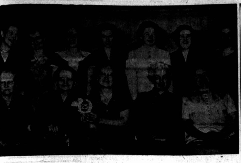
HEAD OF HILLSBORO W. I. 25th YEAR DINNER