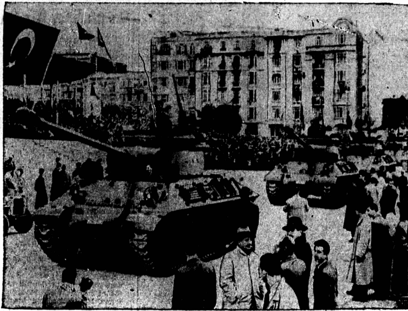
ARMS FOR IKE:

There remains the great problem of reducing the number of cattle breeds. We have already indicated that caution will have to be exercised in this process. In actual fact, it is not only a question of eliminating some inferior breeds, but also — and perhaps most of all — fighting against the spread of half-breeds. It will be impossible of course to prohibit the raising of certain breeds and their half-breeds; but there is a tendency towards the cutting of all state aid to their breeders. Thus, as regards breeds put as it