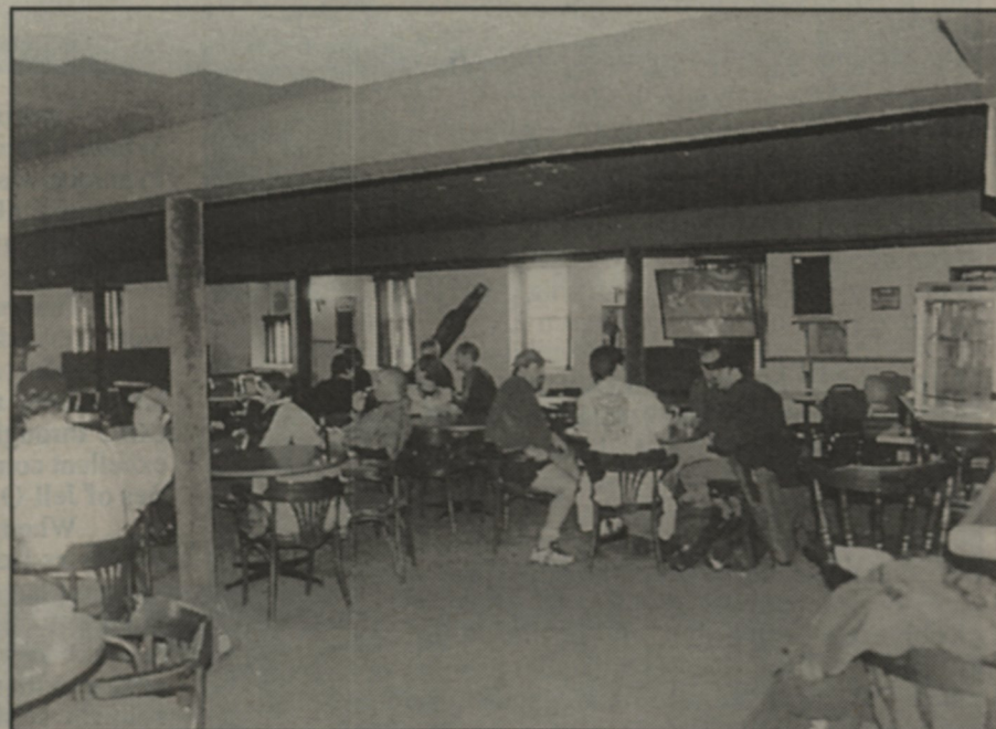
Relaxing at the Panther Lounge