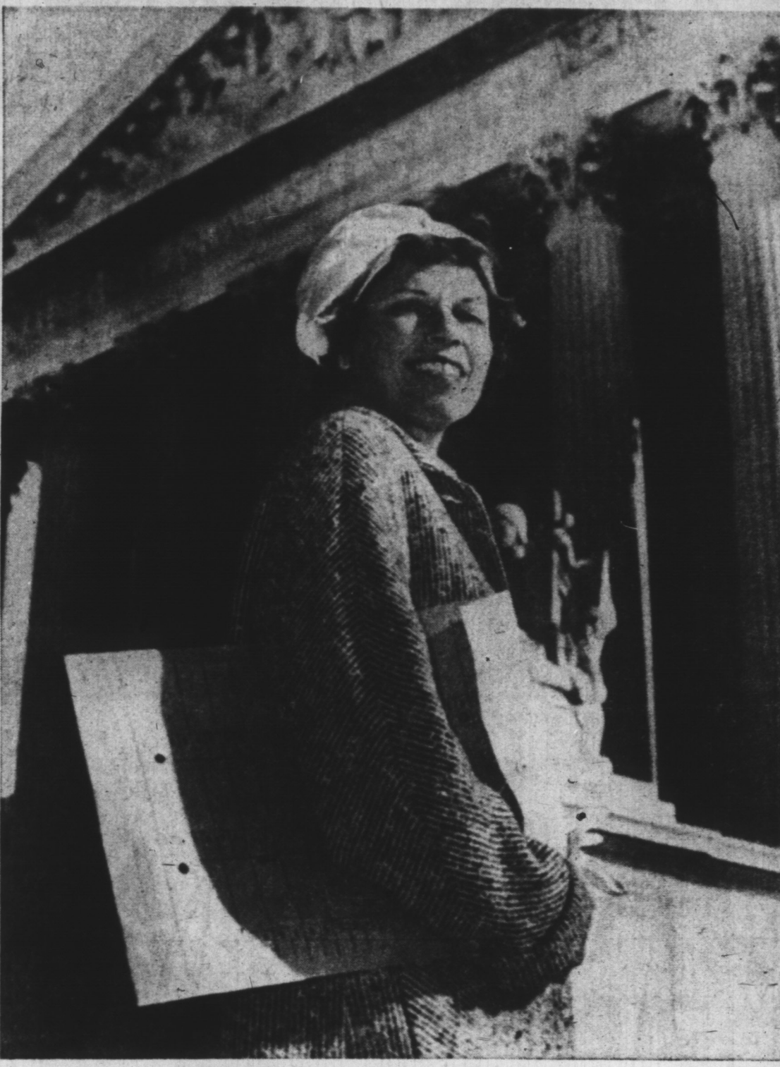
PAPER ON STEEL STRIKE

When winter comes, many small farmers hope to find work in the woods. The logging industry so far has not been affected. But it will be. The farmers are the biggest market of the indus-