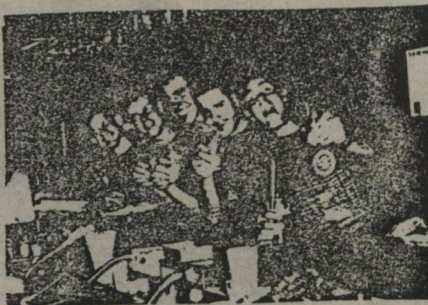
The senseless followers

Congratulations to the X-Press. They are batting 4 for 4 as they have managed to successfully screw up the 4th view from the top. Way to go... not!