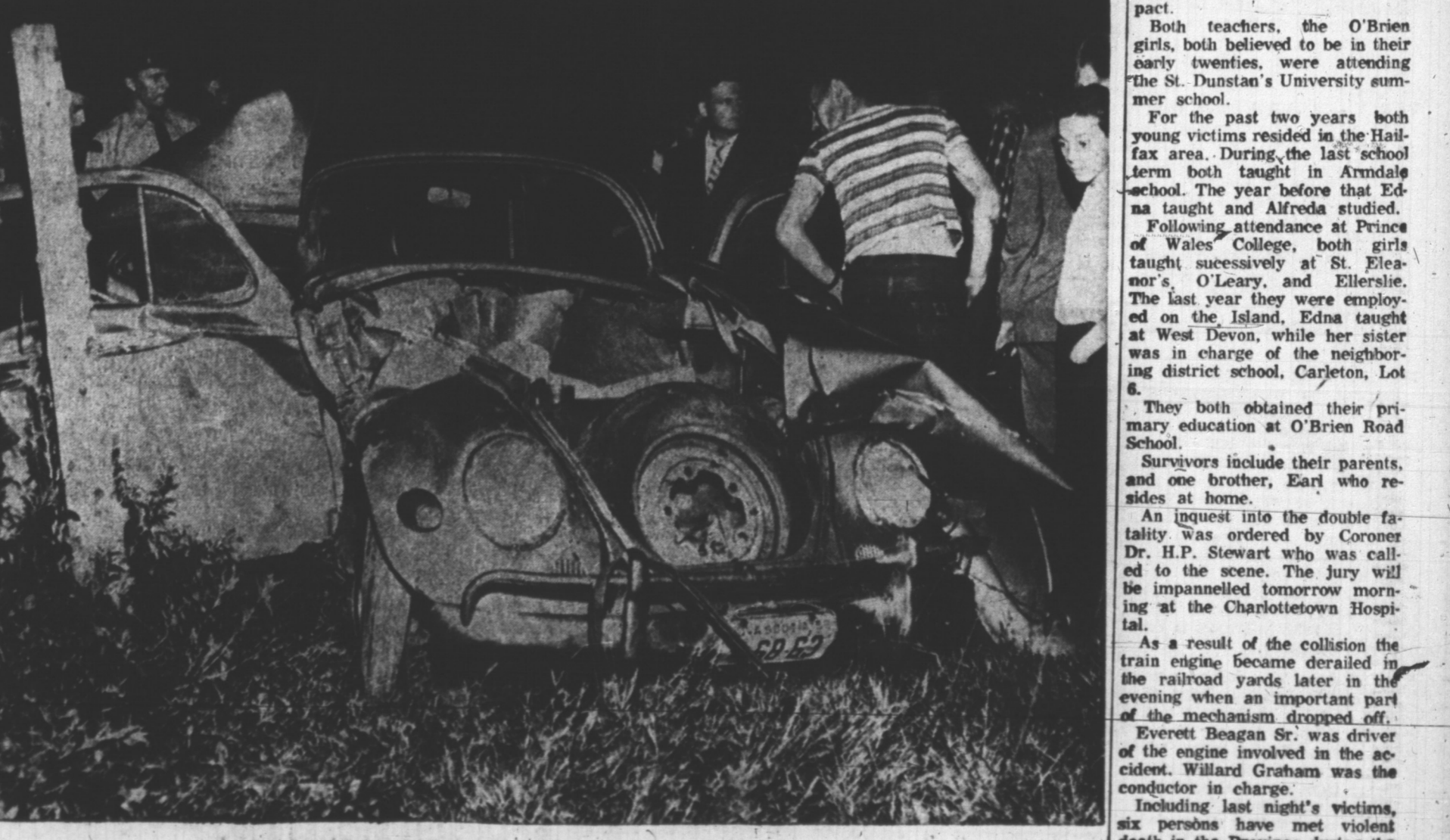
DEATH CAR IS BADLY SMASHED WHEN HIT BY TRAIN