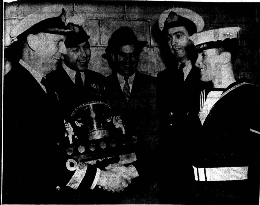
SUMMERSIDE SEA CADETS INSPECTED