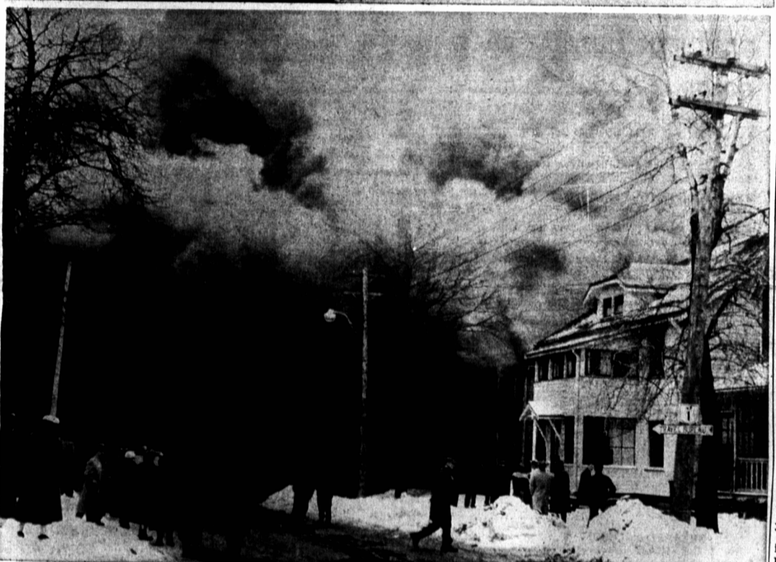
The intensity of yesterday's blaze that swept the premises occupied by Island Tire Service is depicted graphically in the above photos by the Guardian's staff photographer. TOP: City firemen attempt to dampen the flames bursting from the front of the doomed structure. BOTTOM: An impenetrable cloud of dense smoke rolls southeast over Weymouth St. stifling that section of the city under a black oily pall.