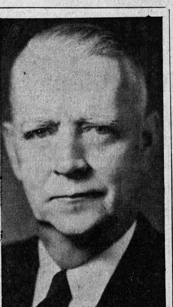
C. N. R. LAWYER