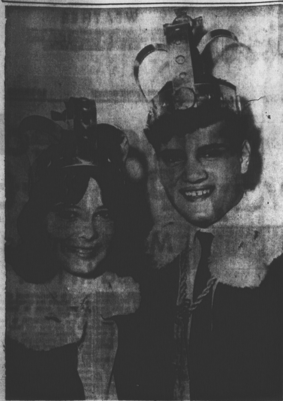
CROWNED ROYAL COUPLE

2 The Guardian, Charlottetown, Tues., Feb. 15, 1966.