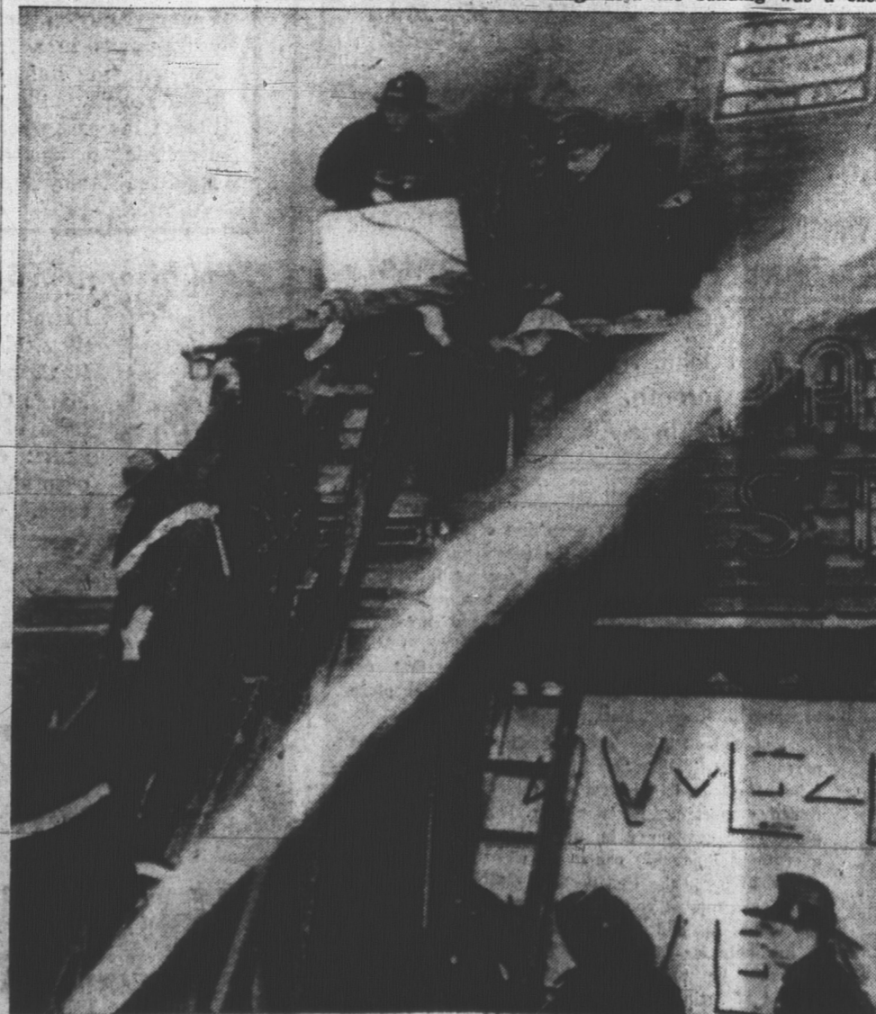
FIREMEN REMOVE one of the victims of a fire in Montreal Friday which killed five persons and injured several others as a stream of water is poured on the blaze.