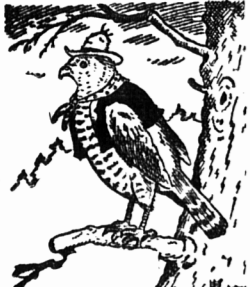
He is Terror the Goshawk.

Now all this time Mother Grouse had been in a different part of the Green Forest with other members of the family. When she returned to see how the young Grouse was getting along, she looked worried. "My dear," said she, "I've just heard bad news. You will have to be extra careful to keep out of sight."