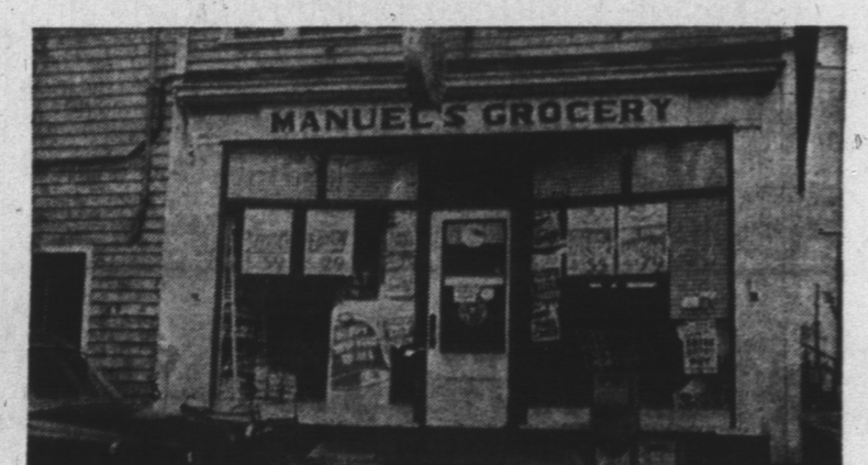
PICTURED ABOVE IS MANUEL'S GROCERY ELM AVENUE