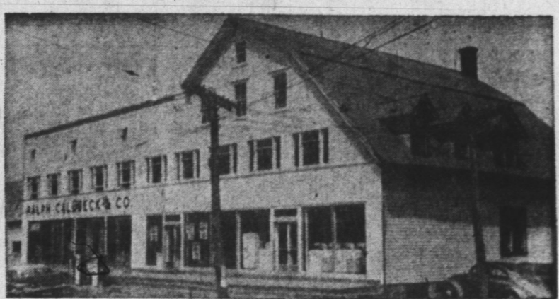
PICTURED ABOVE IS CALLBECK GROCERY BEDEQUE, P.E.I.

We are the distributors for Tyler refrigeration and Sussex refrigeration Canadian built products!