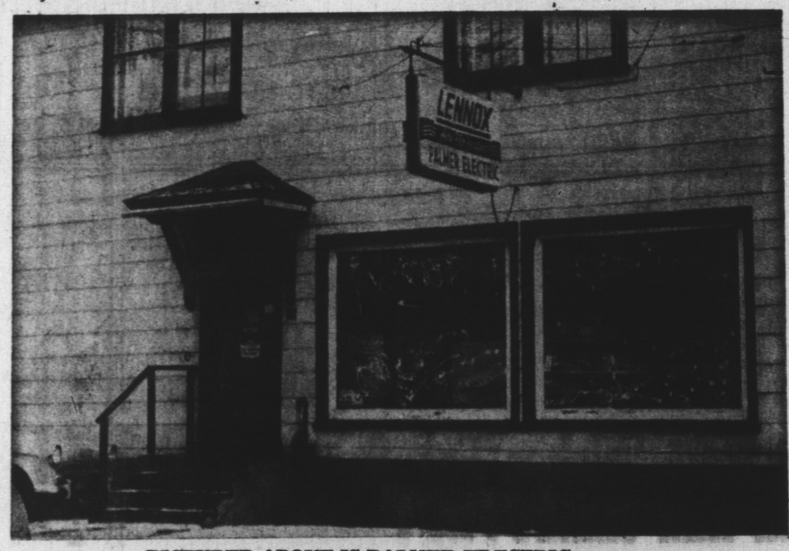
PICTURED ABOVE IS PALMER ELECTRIC The Island's Oldest Refrigeration Firm, Charlottetown

The Tyler line is complete - with over 500 models of commercial refrigerators, refrigerated Sales Cases, Walk-In Storage Coolers, Storage Freezers, shelving, etc.