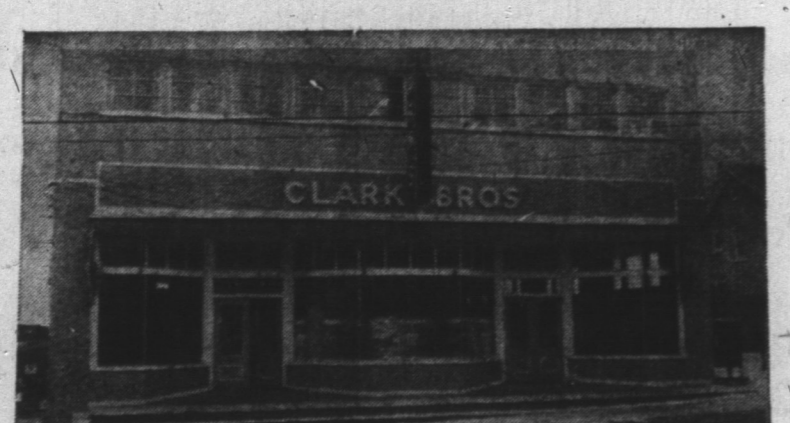
PICTURED ABOVE IS CLARK BROS. MONTAGUE

Here are some of the stores where we have made recent installation. We are only too pleased at any time to give you free estimates and prices. Nothing too small or too large - we do them all, - and they all get the same attention. We are also a member of the Refrigeration Service of Engineers of Canada. Our staff is well qualified and equipped to handle all your repairs.