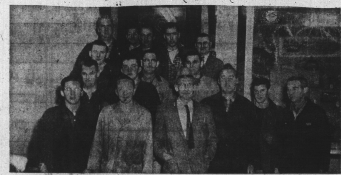
PICTURED ABOVE IS PALMER ELECTRIC STAFF