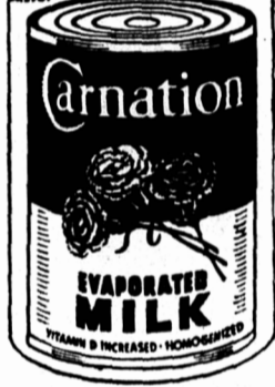
"from Contented Cows"

SPOILS LANDSCAPE GRANBROOK, B.C. —(CP)—Indiscriminate dumping of tin cans and other rubbish along highways and secondary roads was severely criticized at a chamber of commerce meeting. Investigation of enforcing regulations against the practice will be undertaken.