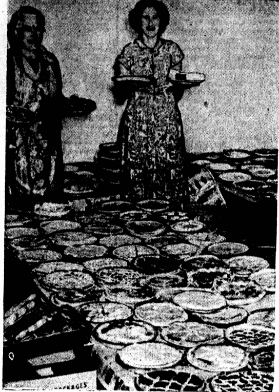
A Total of 235 Pies Were Consumed By Hungry Workers

Barn-raising job on the farm of B. J. McAlpine of Lorneville, Ont., brought 300 farmers out to help with erection of $20,000 structure. The barn, which replaces one ruined last September, is believed to be one of biggest in the province, with floor measurement of 144 feet by 56 feet. While men were working in yard, a few of their wives were busy in kitchen preparing dinner which consisted of 235 pies, 95 loaves of sandwiches, 70 cakes, 75 gallons of tea and several pails of potato salad in evening, undaunted by the day's labors, a barn dance was held to round out the day.