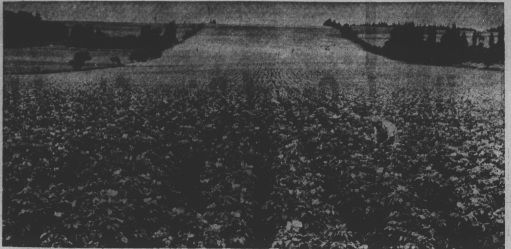
POTATO FIELDS AREN'T LOWLY — THEY'RE LOVELY — ON THE ISLAND