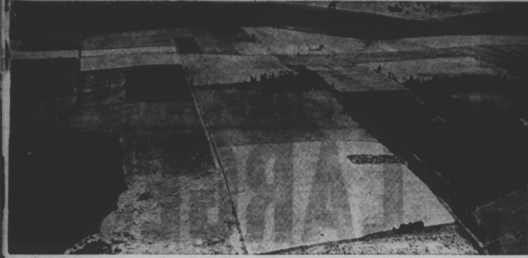
QUIET GRANDEAU RULES IN UNCOUN TED GLIMPSE OF PASTORAL CHARM