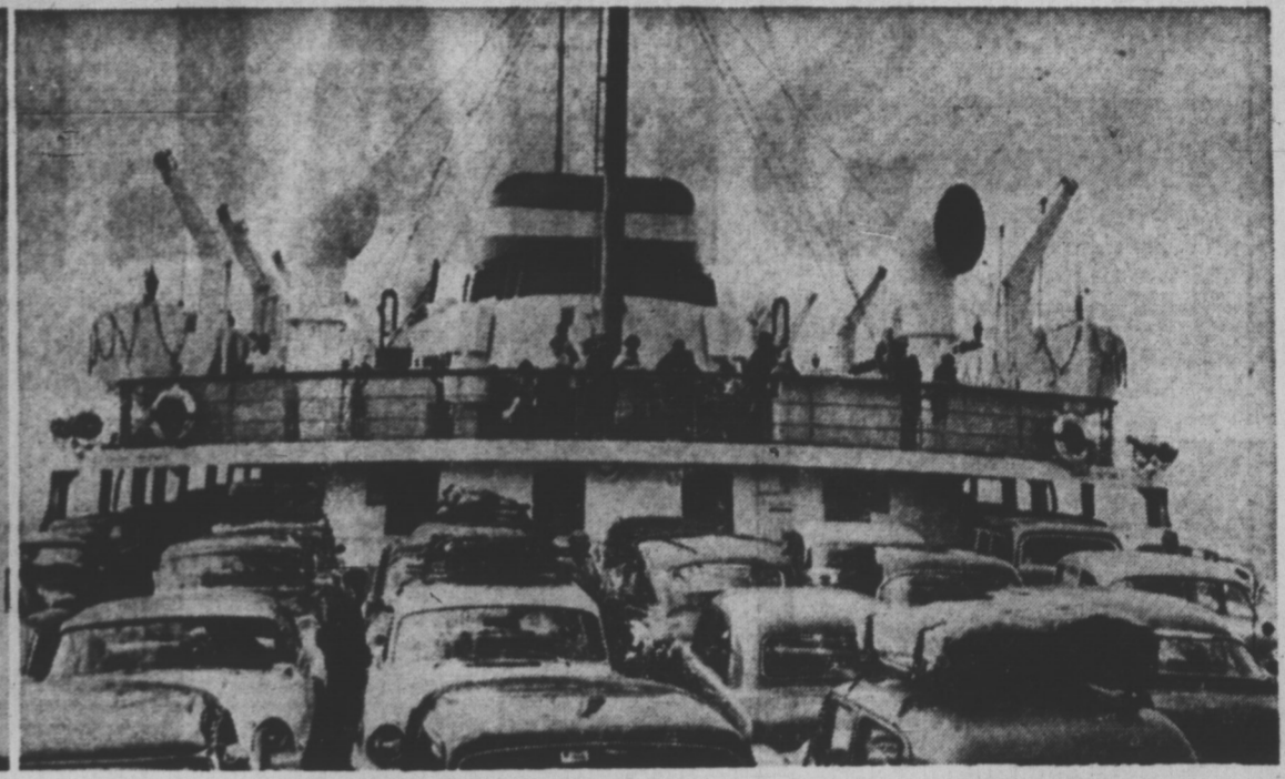
EVEN THE COMING IS FUN ON THE ABEGWEIT

Y.M.C.A. FIRST The first Y. M. C. A. building erected in North America was started here in 1863.