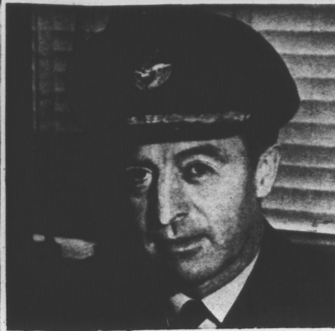
GROUP CAPTAIN DAGG

Crew: four (two pilots, two aircrew). ASW Endurance: four hours or 500 miles. Speed: 120 knots (cruising). Gross Weight: 19,000 lbs. maximum. Dimensions: Fuselage Length - 54' 9", width - 7' 1", height over-all - 16' 8". Engines: two General Electric T-58-GE-4B twin turbines. Detection Equipment: Sonar-ranging set and self-contained navigation system. Armament: Homing torpedoes and depth bombs. With the anti-submarine warfare equipment removed, the CHSS-2 can transport up to 25 troops internally or up to 4,000 pounds of stores externally.