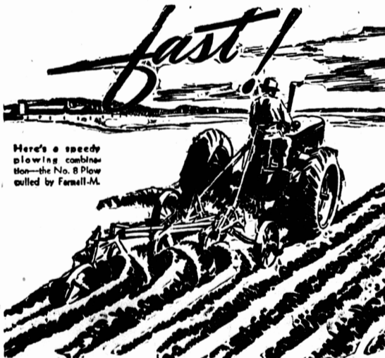
Here's a speedy plowing combination—the No. 8 Plow pulled by Farmall-M.