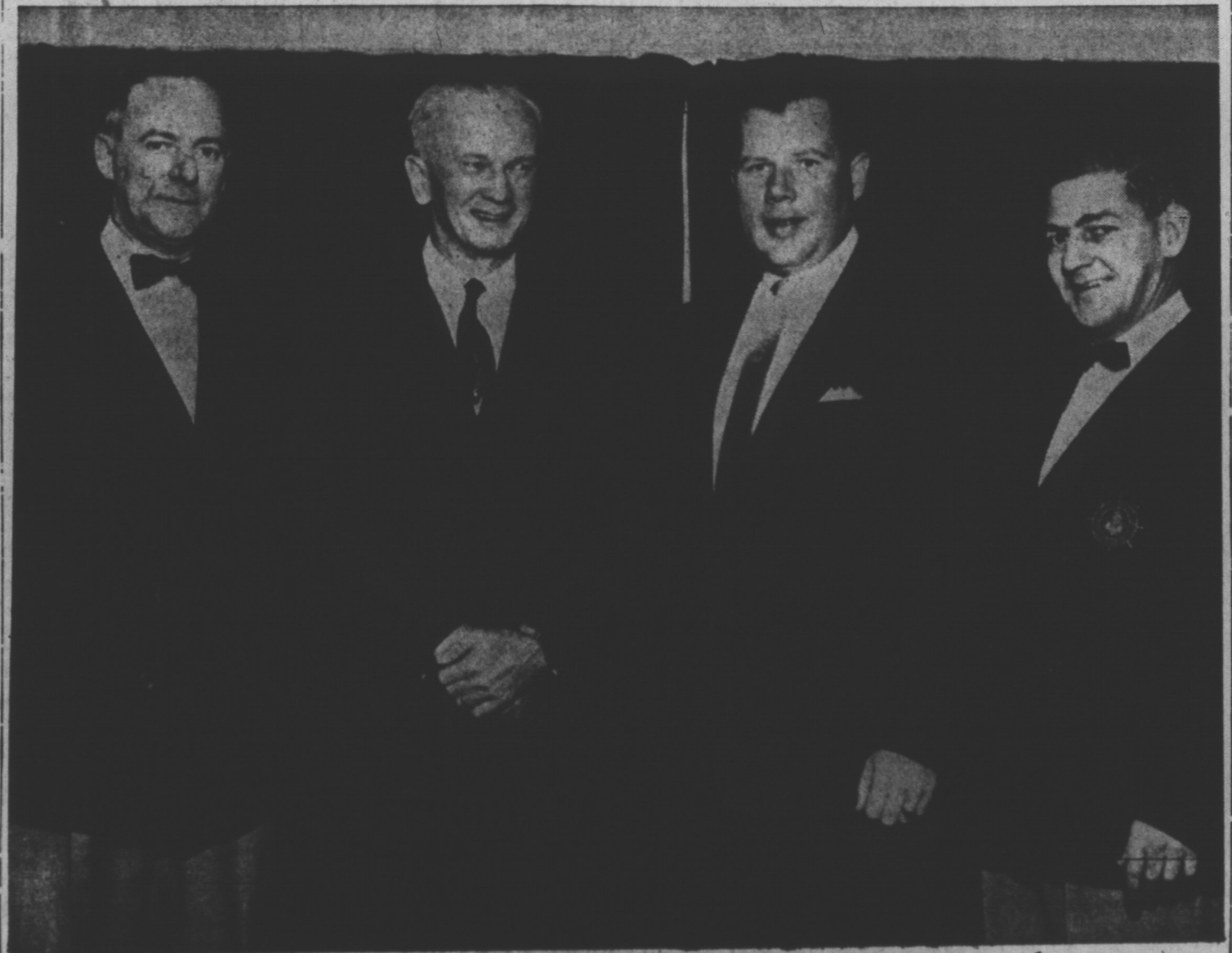
MAIN BRACE OFFICERS CHOSEN

tive attitude on the part of the officers would certainly improve the situation.