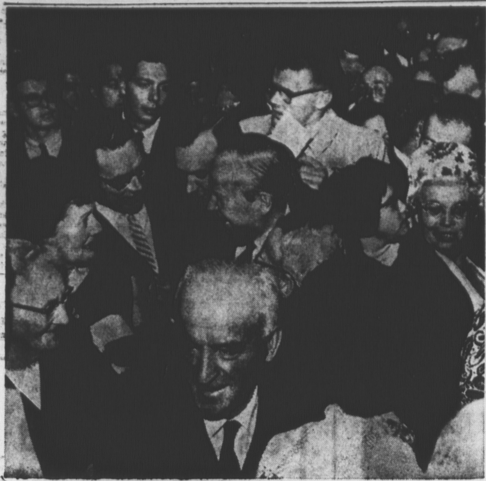
HE'S A POPULAR FELLOW

Surrounded by hundreds of admirers and party followers Prime Minister Lester Pearson