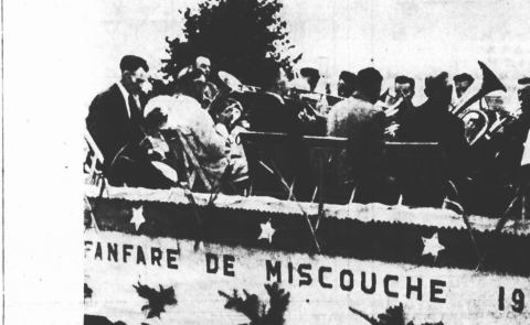
A familiar sight in many parades, The Miscouche Band is seen above on a tractor-drawn float in one of its appearances at the Acadian Bi-Centennial Programs in 1955.