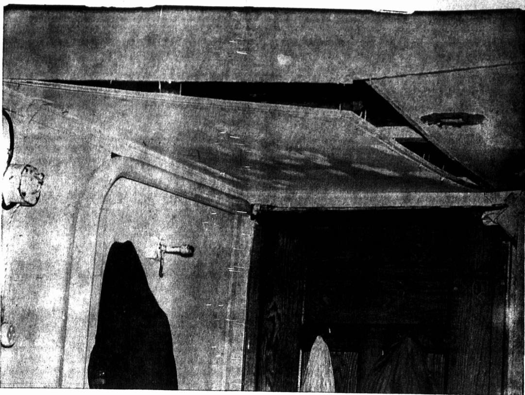
WHERE NARCOTICS WAS CACHED ON SHIP When RCMP pried loose this section of a ceiling in a cabin of the French freighter St. Malo they discovered the biggest haul of heroin ever seized in North America, worth in the hands of peddler some $10,000,000.

CLEVELAND (AP) - Steel prices may be as much as $12 a ton higher by next July, but the rise won't come in one big swoop, Steel Magazine says. The metalworking weekly said the upward revision of prices may start this year and continue through the first half of 1956, reaching the climax when steel wage settlements have to be paid for beginning next July. "Economic pressures have built up to a point where steel producers have no choice but to raise prices," the magazine says. "Wages cost more. Plant construction is more costly. Stockholders are crying for more return on their money." To back up this statement, the trade weekly says the cost of labor has jumped 206 per cent and plant construction costs have gone up 178 per cent during the last 15 years, while steel prices have been increased 126 per cent.