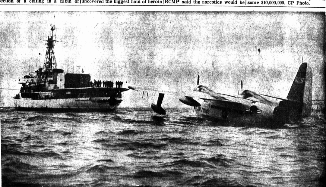
HELPING HAND IN THE ARCTIC HMCs Labrador, the Navy's Arctic partol ship, tows a disabled United States Air Force Albatross amphibian aircraft through icy waters dock landing ship for repairs. The Warning radar line. (CP from Northern Defence).