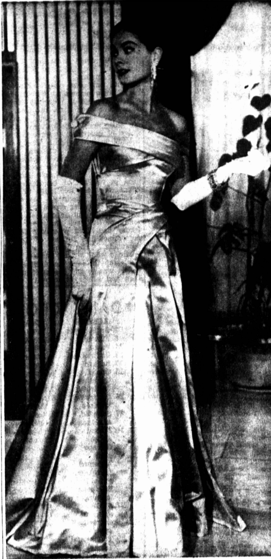
LONDON DESIGNED This is an evening dress in cream acetate satin designed in London. The intricately cut, crossed pannier line of the skirt is repeated in the bodice. The panels button at the side, waist and shoulder.

HOUSING CAMPAIGN It has therefore started a campaign to raise 10,000 guilders ($2,630) to provide new storks' nests and renovate old ones. It is hoped this sum will provide about 50 good nests which the storks will find waiting for them when they return each spring after spending the winter in Africa. This country is short of some 200,000 houses, and since this problem is expected to take many years to solve the storks probably will be better off than most average Dutch families in having a place of their own in which to live. The storks' "housing shortage" caused fierce fighting among rival pairs of birds in some parts of the country last year. Pitched battles were held over the right to a nest, with the result that a large number of eggs and young birds were thrown out and lost. Only 96 storks were hatched in Holland last year, as compared with well over 1,000 before the First World War.