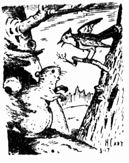
"You should see Prickly Porky's latest baby," said Sammy.

Chatterer the Red Squirrel is one of those folks who wants to see for himself. Because of this, Chatterer is not too well liked by the other Green Forest folk. He has a way of too often being where he isn't wanted. It was Sammy Jay who told Chatterer about Baby Prickles. "You should see Prickly Porky's latest baby," said Sammy. "Why should I see a baby porcupine? I've seen baby porcupines before," replied Chatterer. "You've never seen one like this one!" said Sammy Jay, and there was something about the way he said it that made Chatterer wonder. "All baby porcupines look alike," declared Chatterer. "No they don't," retorted Sammy Jay. "You never would repeat that statement if you should see this baby." "What is there about it so different?" demanded Chatterer. "He is white instead of black," declared Sammy Jay, and chuckled at the expression on Chatterer's face. "I don't believe it. No, sir, I don't believe it," said Chatterer. "Who ever heard of such a thing as a white porcupine?" "What about a white Red Squirrel?" asked Sammy Jay slyly. For once Chatterer seemed to have lost his tongue. You see, a long time before one of Chatterer's own children had had a white coat instead of a red one. "That's different," said he at length. Chuckling, Sammy Jay flew away. "I don't believe it," Chatterer kept saying over and over to himself.