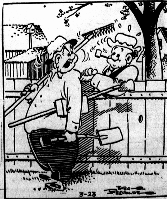
"The Guardian Want Ads are loaded with garden supplies — better hide them from your wife!"