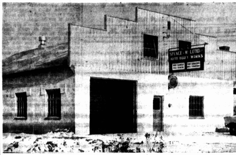
Exterior of Auto Body Plant

The opening of their body shop today means that Prince Edward Island has its first complete auto body plant, equipped to capably perform the following work: Frame straightening, wheel alignment and wheel balancing, all body repairs and paint jobs. And inside their ultra-modern building they have the equipment to do these various jobs. They have the first and only wheel straightener in Prince Edward Island. Until now it has been necessary to send wheels out of the Province in order to have them straightened. They are also equipped with the only custom frame straightener in the Province which is combined with modern John Beam Visualizer machine for lining up the front ends of automobiles and trucks. Their paint shop is one of the most modern in the Province. It is extremely well lighted and is shadow free at all times. It is lighted by fourteen 300 watt light bulbs. Two hours after a car has been painted it will be ready for use by the customer. All of these machines and facilities are housed in a concrete