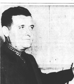
Winter Fair with his champion ship barley exhibit.