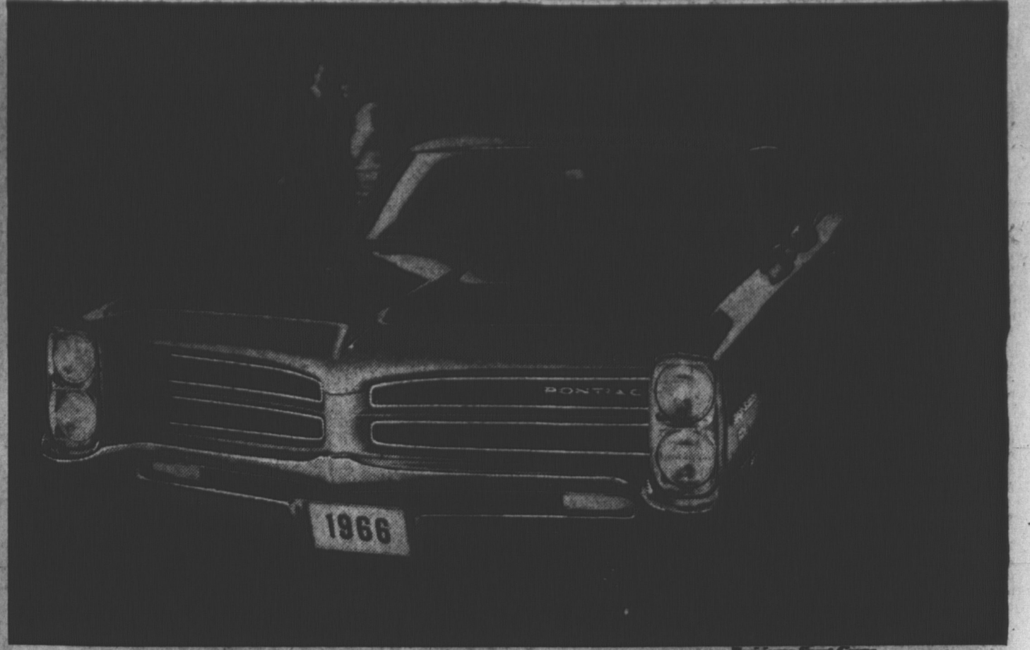
Parisienne Sport Coupe