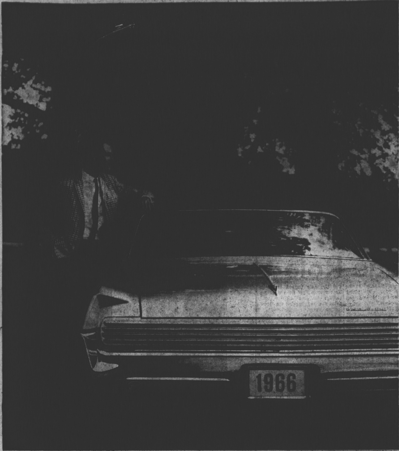
Grande Parisienne Sport Sedan