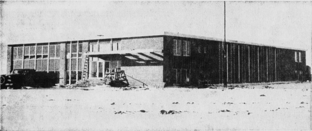
KINKORA IS ALSO SITE OF LOW, FLAT MODERN SCHOOL

The largest production ever staged by the Summerside High School Theatre Guild, and probably one of the largest dramatic performances shown in Summerside for some time will be presented January 15, 16, 17 when the Broadway musical play "The King and I" takes to the stage in Summerside's Civic Auditorium.