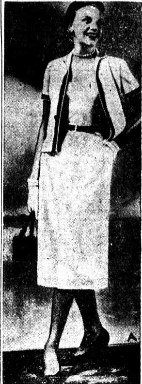
By ALICE ALDEN

Out go the ships with every stateroom booked to capacity. The distaff side has planned, purchased and packed, and while some wardrobes will be right, others will be made up of clothes that seem right nowhere.