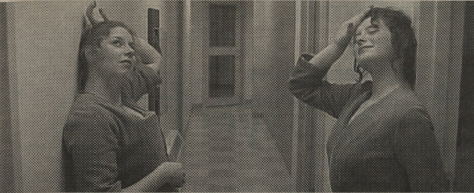
After being lured upstairs to The Cadre office, two beer wenches proceed to faint.

Actually, it doesn't really mean "sociable." People were just so drunk that "slon-shava" started to sound like "sociable," and the word changed. So we lead people to screaming "slon-shava" which had a number of variations: slow-shovel, sun-sheebea, sloan-ciable, and so forth.