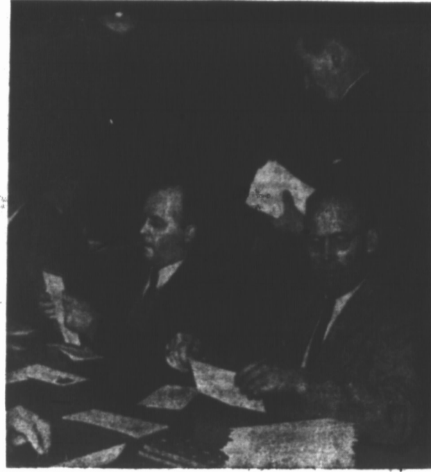
Rotary Club Members Stuffing Easter Seals