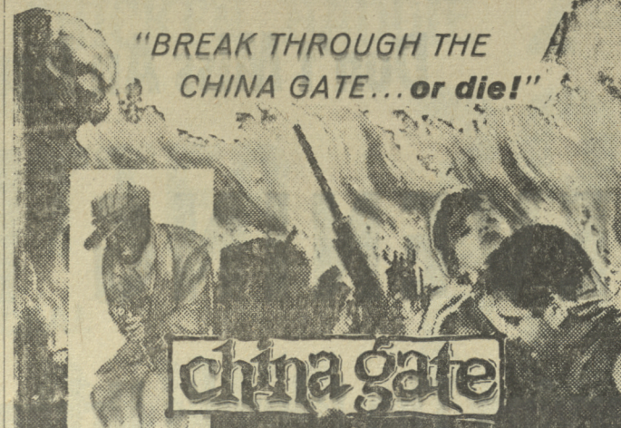
GENE BARRY - ANGIE DICKINSON - NAT "KING" COLE

Told through the smile of a child . . . the cunning of an Eurasian girl . . . and the fury of a battle-crazed American!