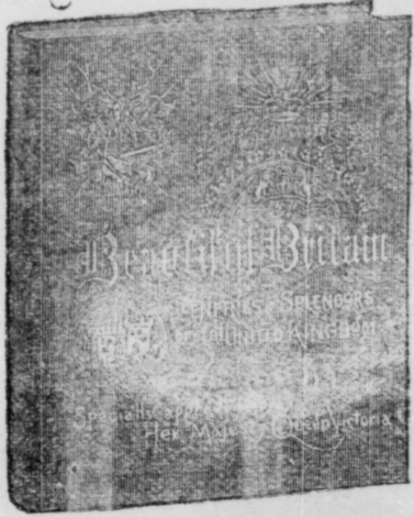
Large quarto volume (11 1/2 x 13 1/2 ins.), 385 pages. Extra enameled paper. Extra English cloth, emblematic embossing in ink and gold.

A magnificent collection of views, with elaborate descriptions and many interesting historical notes. Text set within emblematic borders, printed in a tint. A fine example of up-to-date printing.