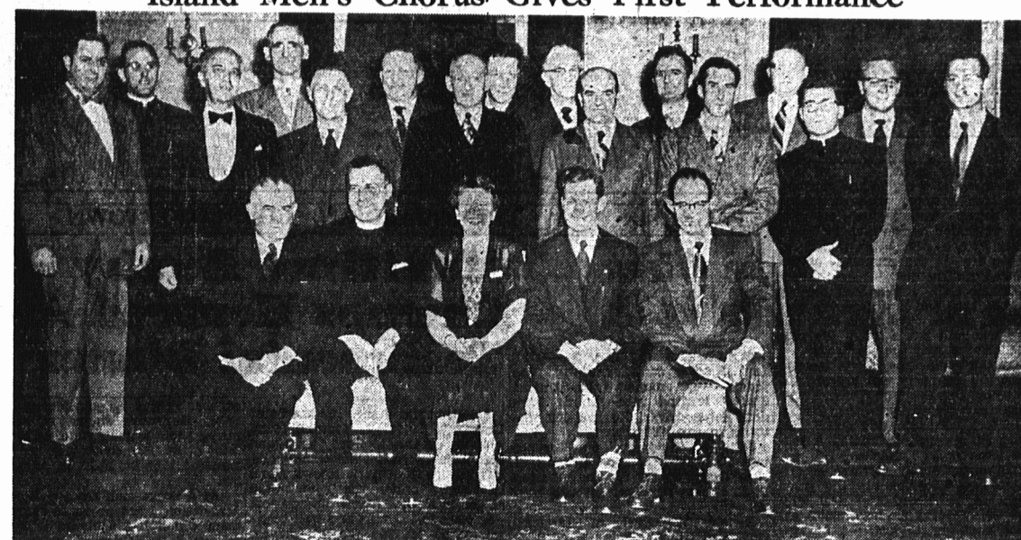
Above is pictured members of the Men's Chorus who made their premier appearance Tuesday night at St. Andrew's dinner at the Charlottetown Hotel. The group rendered several selections which were roundly applauded and drew much favorable comment.