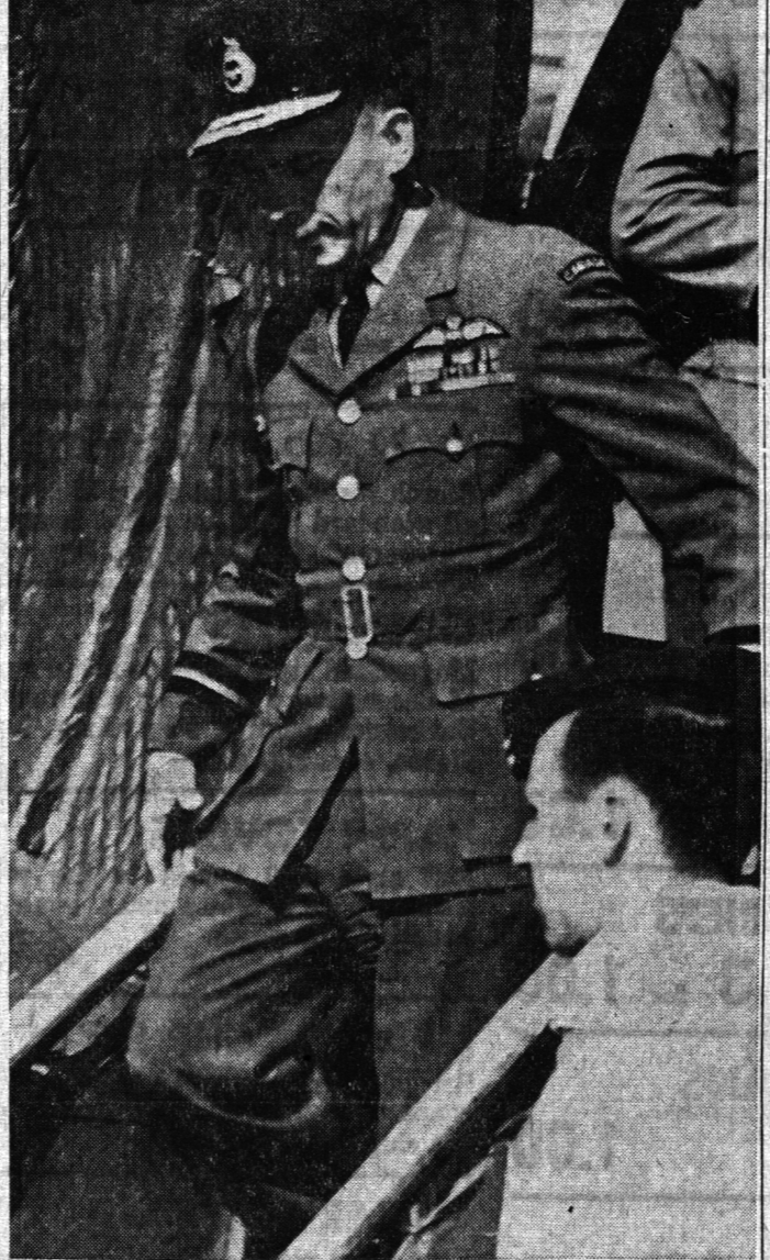
NEW AOC VISITS S'SIDE

Waite of Kensington. The Camp area will not rest in stillness very long as the Junior Girls Camp soon begins and with a registration of 40 girls between ages 9-12 there is certain to be active time.