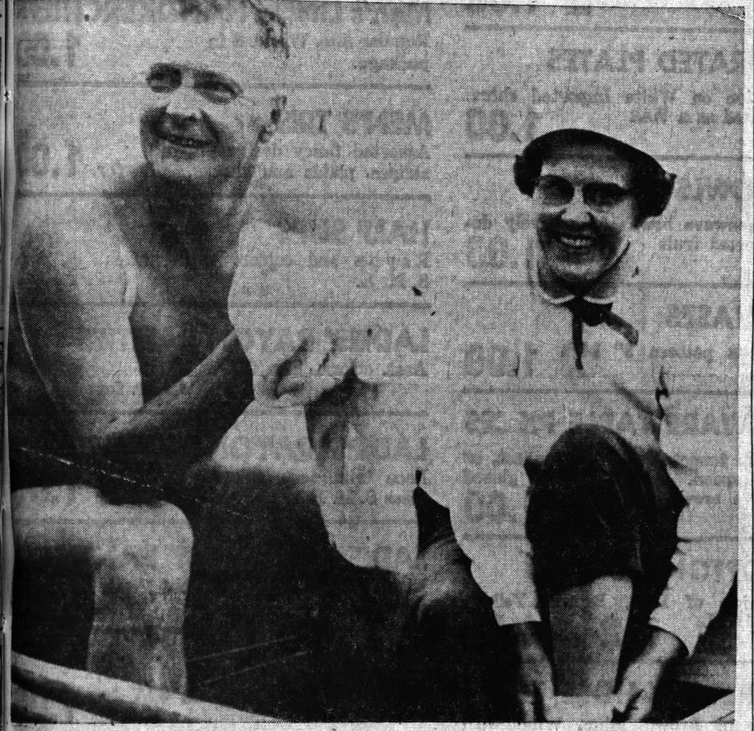
WIFE GREET'S LAST YEAR'S WINNER, SECOND

Aquatic day continues to grow each year. This year the program was expanded and there were more entries in both swimming and boating events. The public address system was all that could be desired. Parking space on both sides of the river