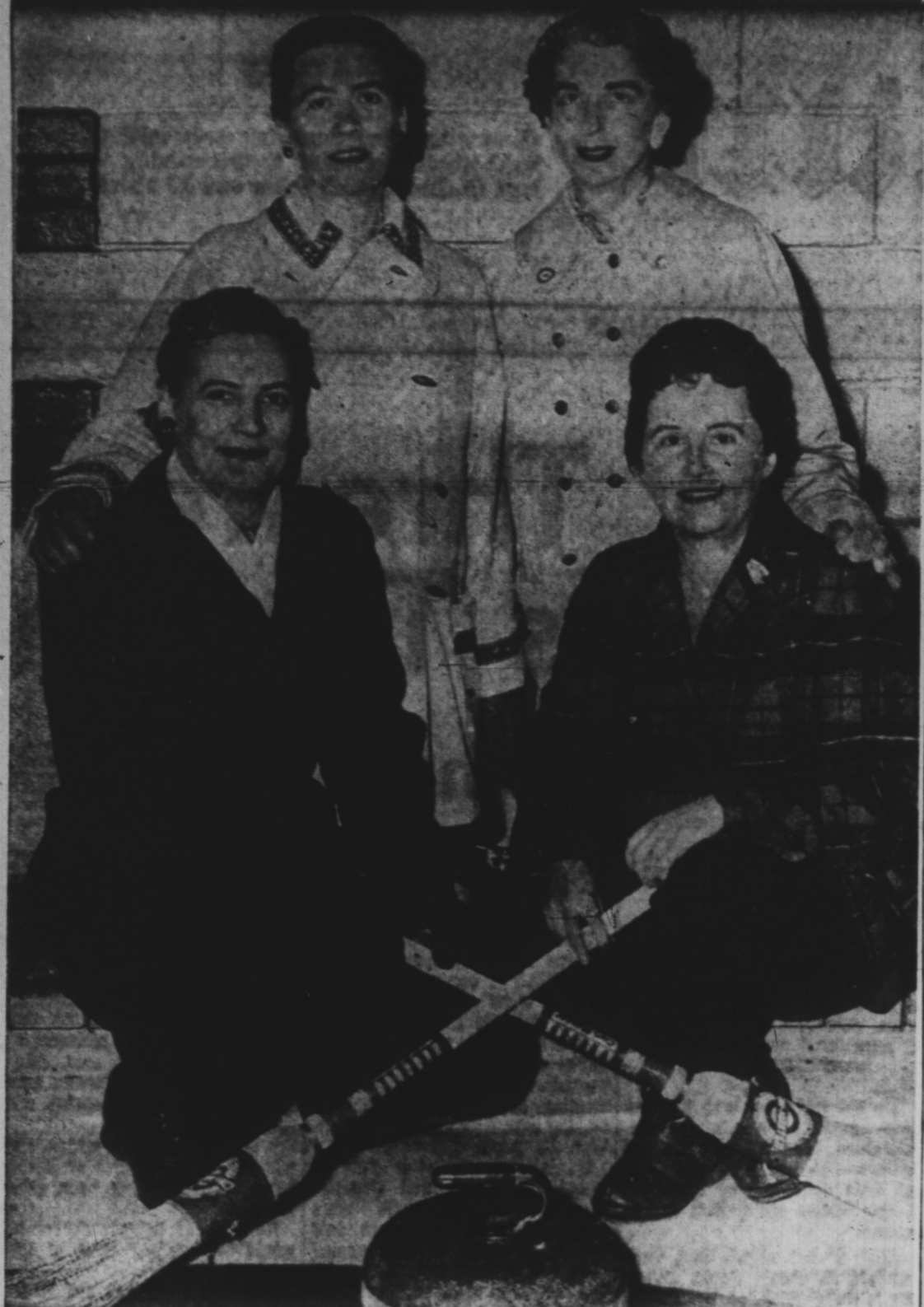
Members on the Summerside Curling Club who won the Friday night competition entitling them to represent the Summerside club in the ladies provincial curling championship for the Crockett Trophy commencing in Charlottetown tomorrow are