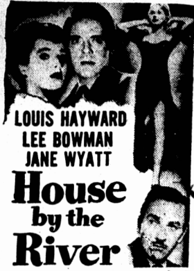
LOUIS HAYWARD LEE BOWMAN JANE WYATT House by the River