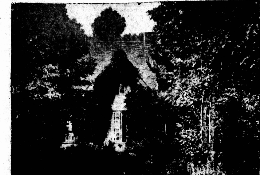
Woodside family home of the late William Lyon Mackenzie King, at Kitchener, is seen here. Its grounds are to be converted into a park and picnic area and will be preserved as a national historic site. The house itself will be furnished with some of Mr. King's personal belongings and family heirlooms. It will also feature art gallery, library.