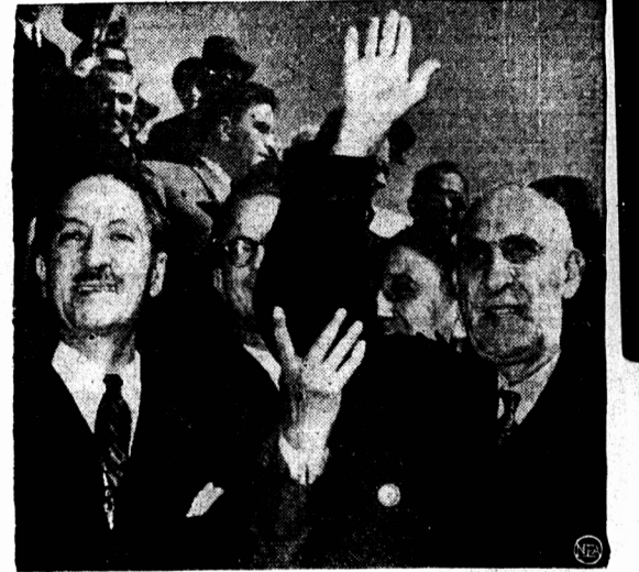
MOSSADEGH MAKES IT — Iran's ailing Premier Mohammed Mossadegh waves to the crowd that met him as he arrived in New York. He was so weak that an aide has to help him hold his arm up. At left, on hand to welcome him, is Iran's Nasrollah Entezam, president of the U.N. General Assembly. Mossadegh will address the U.N. on the Iranian-British oil dispute.