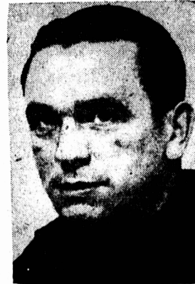
Forty-two-year-old Kurt Meyer, former Nazi general who was held responsible for the deaths of 18 Canadian prisoners of war in Norway in June, 1944, has been flown to a British military prison in Germany where he will continue to serve out his life sentence along with other German war criminals. Approval for his return was granted by federal cabinet in Ottawa, thus ending his stay in Canada which began on April 30, 1946, when he entered penitentiary at Dorchester, N.B., after probably the most famous military trial in the 20th century Canada has known and the first war crimes trial in the country's history.