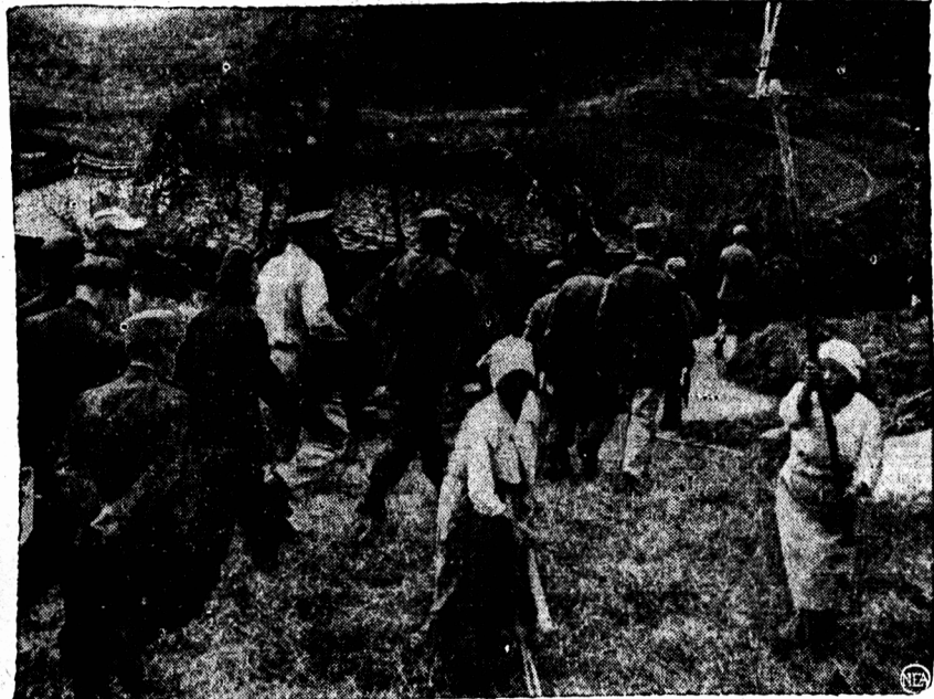
NO TIME OUT —Two Korean women continue threshing grain with ancient flails, oblivious to the Allied and Communist liaison officers walking close by. The U.N. and Red officers were returning from an investigation of a hilltop strafing near Kaesong. Identifiable among the U.S. representatives is Col. Donald O. Darrow (wearing light shirt and carrying jacket).