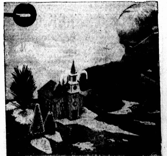
NOT SNOWDRIFTS, BUT "MOLD-DRIFTS" — This model "town," built on a large culture plate by GE engineers at Nela Park, Cleveland, Ohio, was left for a few days in a warm, humid atmosphere. Mold began to grow—the same kind Mama sometimes finds on stale bread. But a small germicidal lamp was left shining on the model. No mold grew where the lamp's ultraviolet light shone, but in the shadows cast by the buildings and trees, green and white mold grew rapidly and thickly. The effect was the same as in late winter, when snowdrifts in the shadows remain unaffected by the sun. So the "snowdrifts" in this picture are really "mold-drifts".