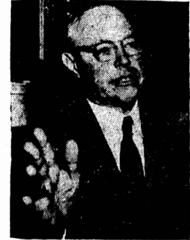
Senator Robert Taft of Ohio, sometimes called "Mr. Republican," is shown in Washington as he formally announced that he is a candidate for the U. S. Republican Presidential nomination. The Senator said he is confident that he will be nominated by the Republican party and that he will be next President of the U. S.

While mass movements of U.N. troops and tanks are making the headlines, little mention is made of men like this wounded South Korean, seen here being helped to an aid station after he was hit by Red artillery fire. Many South Koreans are performing doubly courageous duty at the front, carrying ammunition up to the line under constant bombardment from the enemy and bringing back the wounded on litters on return journey.