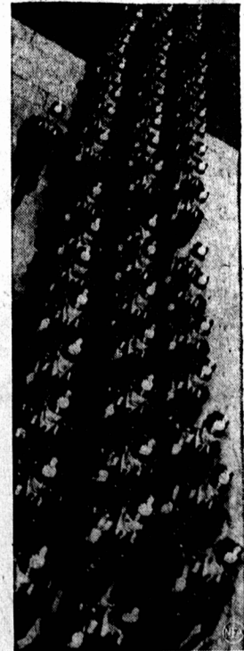
ANTI-COMMIE COPS — Making their first public appearance, members of the new West Berlin "alert police" march as smartly as West Pointers as they enter the Olympic Stadium in Berlin's British Sector. Organized to quell future Communist riots, the carbine-armed force will be expanded to about 3000 men by year's end.