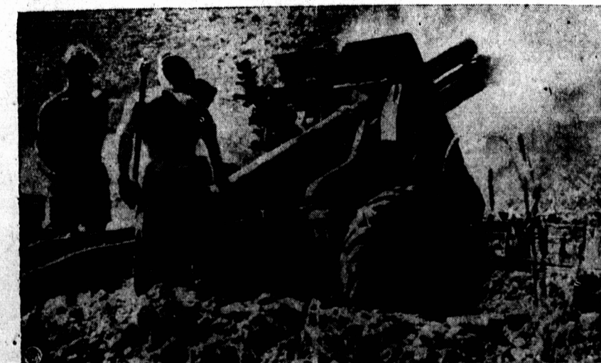
FIRE POWER — Bare-waisted New Zealand artillerymen fire their famous 25-pounders at dug-in North Korean positions. One cannoner stands by to deliver another round in the gun which is kept smoking during the current U.N. offensive.