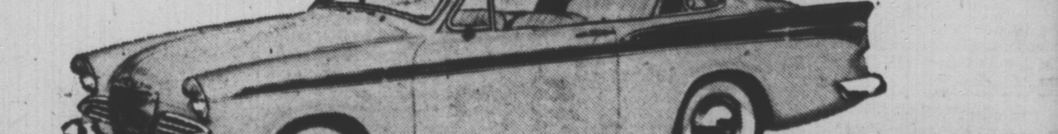
SUNBEAM RAPIER HARDTOP Suggested list price at port of entry $2539 inland freight charges additional, equipped with built-in heater and defroster, 2-speed electric windshield wipers, turn signals, full flow oil filter, full chrome wheel discs, tachometer, sports gear shift, tubless tires and spare, two-tone finish. (Whitewalls and over-drive extra).

Provincial and Sales Tax extra where applicable