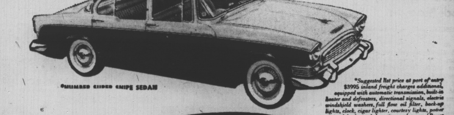
HILLMAN HUMPER Suggested list price at port of entry $3995 inland freight charges additional, equipped with automatic transmission, built-in heater and defroster, directional signals, electric windshield wipers, full flow oil filter, back-up lights, clock, cigar lighter, courtesy lights, power assisted brakes, tubless tires and spare. (Power steering optional extra)

You have but to see this "triumphant trio" to recognize their quality. You have but to drive them to feel their pull. Visit your nearest Rootes dealer right away. There are over 200 across Canada, supplying parts and service from coast to coast.