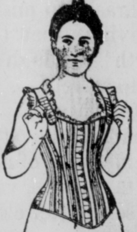
FERRIS WAIST. Style 222. $1.00 Ladies' medium form. Extra long waist. Superfine finish. Bottomed front. Laced back. White, Drab and Black.

Same grade in long waist, same material, tape fastened buttons, removable steels, patent buckles for hose supporter, shoulder straps, etc. The sketch represents it very nicely.