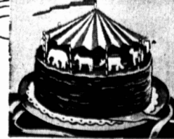
CIRCUS — Spice cake — chocolate icing — decorate with animal crackers marching upright under a "tent" of colorful accordion-pleated tissue paper. Tent "props" are cellophane straws.