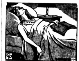
To avoid fires, never smoke when you are sleepy, and especially when you are in bed. Always see that your cigaret is out before you throw it away.

skirts with huge sashes tied with chocolate box bows behind. The accent was on heels in accessories. Ferragamo had embroidered heels on evening slippers. Dal Co showed raptier heels in Toledo steel, and in brass, silver heels with brass spurs, crescent moons on Turkish slippers and mercury-wings on the high heels of dancing pumps. A new Italian shoe firm