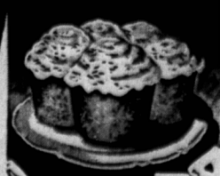
BRIDGE PARTY — White cup cakes with white icing. For fun and flavor, coloured sprinkles or chopped almonds to top the