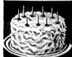
BIRTHDAY — Nothing nicer than white cake with pink icing — red roses to hold white candles. Make it a pretty pink, red and white party!