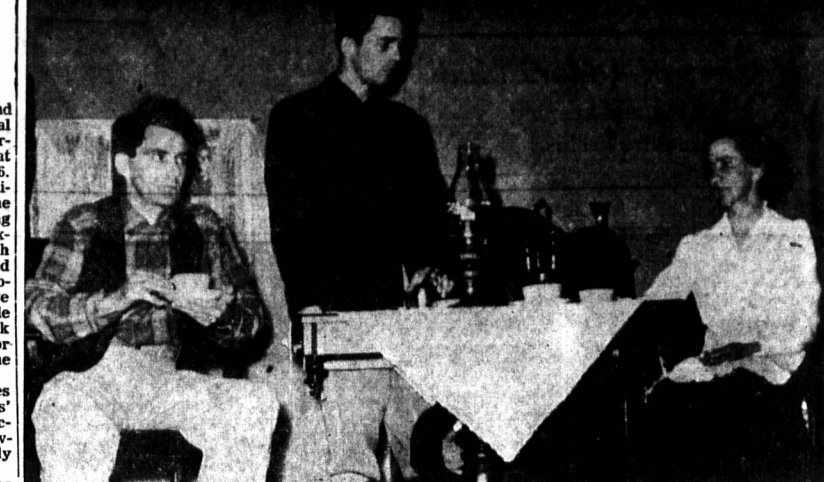
CRAPAUD PLAY IN FESTIVAL

SATURDAY, 10 a.m. to 12 and 2:30 to 5:30 p.m. - Instructions on various types of dancing and dance teaching. 9 p.m. to midnight - Square, folk and contra dancing for everyone. Frank Kaltman and other callers.