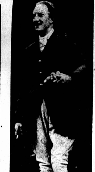
The rumored romance between the Earl of Dalkeith, right, and Princess Margaret Rose, above—

of miles away from Britain's capital, even though a marriage between the royal princess and the red-haired 29-year-old heir to 500,000 acres and six castles would have been a matchmaker's dream.