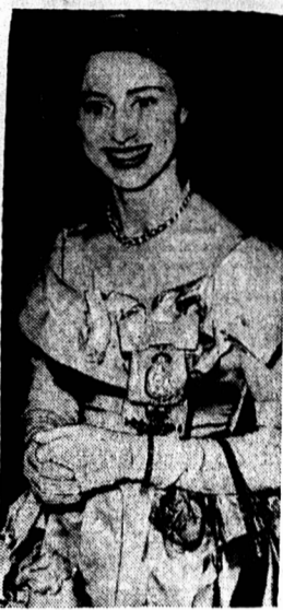
The rumored romance between the Earl of Dalkeith, right, and Princess Margaret Rose, above—

which was expected by some to end in marriage—has been thwarted by the third heir to the British throne, who apparently has decided to dedicate herself to duty for the next couple of years at least.